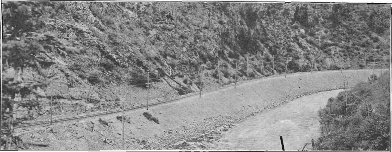
Along the Right of Way of the Chicago, Milwaukee & St. Paul