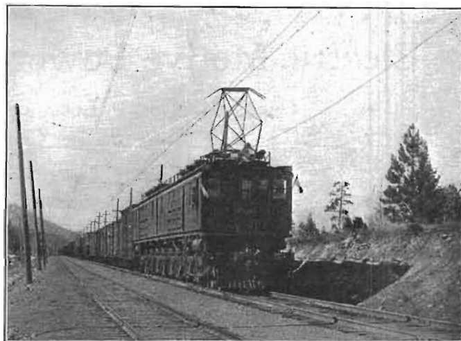
A C. M. & St. P. Freight Locomotive with a 100-Car, 5,000-Ton Train, Eastbound at Thelma on the Missoula Division

Before considering operation down grade, a comparison may be made between steam and electric locomotives as regards their ability to start a heavy train. The electric locomotive is superior because in the first place the torque on a steam engine is not constant, but varies depending on the position of the cranks. In the second place it is difficult to judge exactly the drawbar pull being developed by a steam engine during the time that the slack is being taken in the