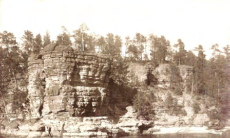
Chimney Rock, "The Dells" Kilbourn, Wis.

Nature was in a lighthearted mood when she fashioned the Dells. Glacial rocks, grotesquely carved, weird canyons and gullies vary the wilderness of her handiwork.