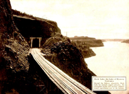
Rock Lake, the Lake of Mystery Washington

Beyond the Palouse plateau, Rock Lake lies beneath jagged peaks. Its unusual depths and unusual colors have long captivated men in the Indians.