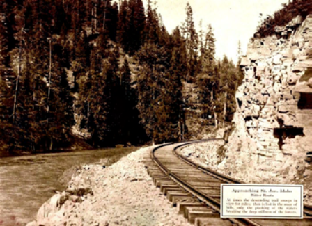
Approaching Mt. Lee, Idaho Winter Woods

As soon as the descending trail ceases to view the valley, there is but in the mass of trees, only the plucking of the water leaving the deep stillness of the forest.