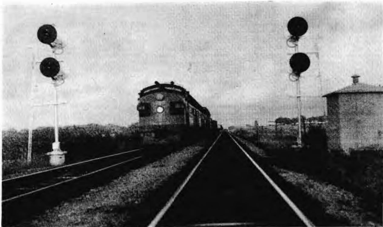
TRAIN MOVEMENTS signaled both ways on each track of double track helped give the Milwaukee the flexibility and . . .