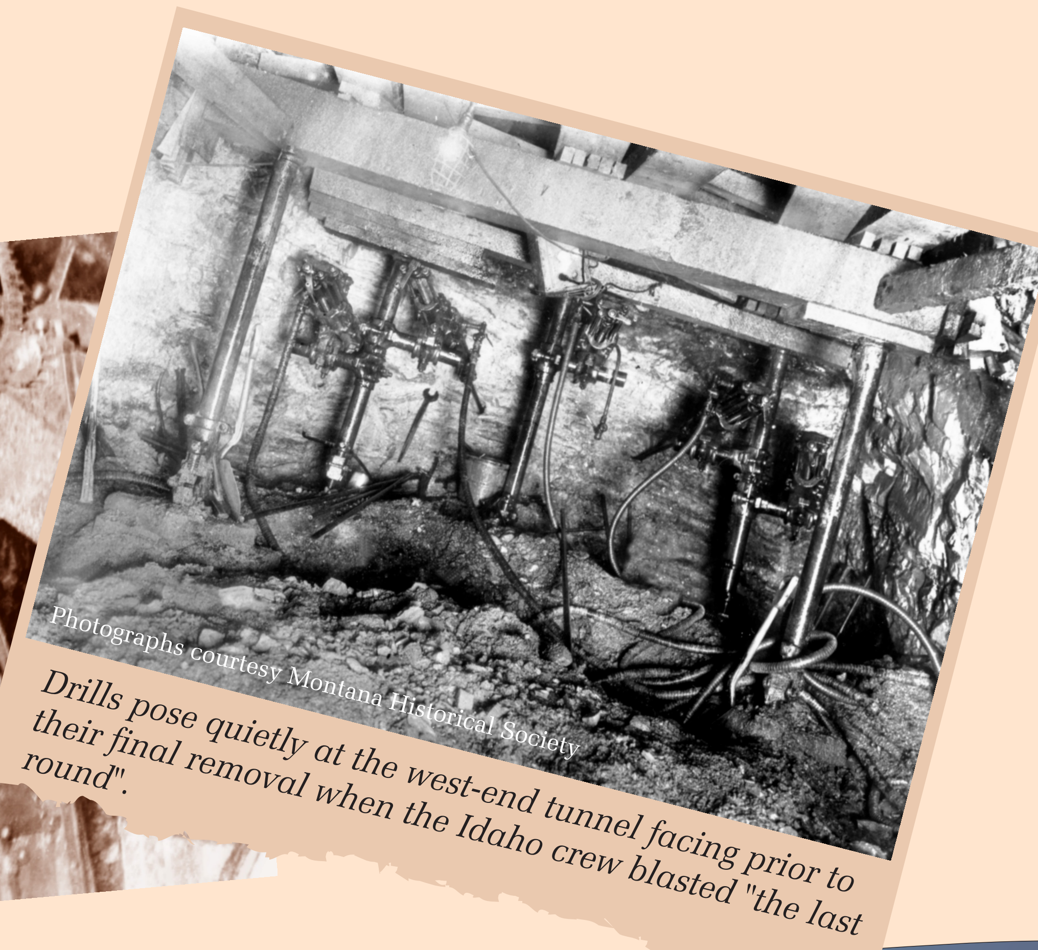
Drills pose quietly at the west-end tunnel facing prior to their final removal when the Idaho crew blasted "the last round".

It's unknown exactly where the east crew met the west crew, but the Montana/Idaho state line is right down the middle of this sign. You're standing in two states!