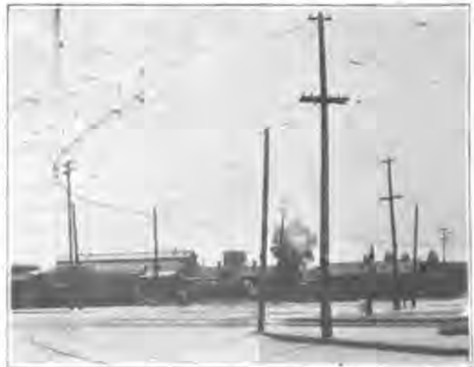
A 507-FT. TROLLEY GUARD INSTALLED ON A CONTINUOUS CURVE OVER THIRTEEN STEAM ROAD TRACKS

ON ONE of the Council Bluffs, Iowa, lines of the Omaha (Neb.) & Council Bluffs Street Railway the track crosses at grade a group of thirteen steam railroad tracks, including main-line tracks of two railroads, and at the same time curves through an arc of about 75 deg. The difficulty of holding the trolley