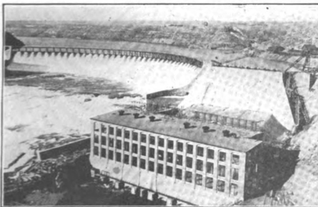
Great Falls Dam and Power House at Volta. One of the Chief Sources of Power Supply.