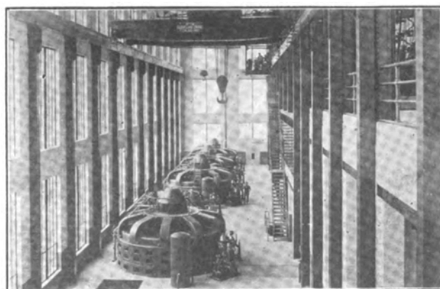
Interior of Volta Power House, Showing Four 8,000-Kilowatt Vertical Generators.

Entire success with important economies has marked the partially completed electrification of the Rocky Mountain divisions of the Chicago, Milwaukee & St. Paul Railway. The general scope and many of the details of this epochal electrification have already been described and illustrated in the ELECTRICAL REVIEW AND WESTERN ELECTRICIAN of December 26, 1914, and October 23, 1915. The first electric locomotives were placed in regular service last December on the 115-mile division crossing the Continental Divide, where they were given their initial tryout under the severest service conditions. Last April electric service was extended to Harlowtown, making 220 miles of electrified road. By November 1, 1916, it is expected that steam engines will be superseded over the entire stretch of 440 miles from Harlowtown, Mont., to Avery, Idaho. Among the advantages of electrified service have been found the following: Reduction in running time, haulage of heavier trains, regenerative braking with reduced wear and tear, freedom from trains being stalled in winter, absolute cleanliness, and popularity with the travelers.