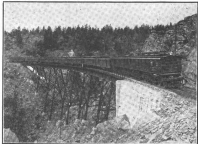
Chicago, Milwaukee & St. Paul Electrified Freight and Passenger Trains, Descending Two-Per-Cent Grade on Eastern Slope of Rocky Mountains. Double-Unit, 3,000-Volt, Direct-Current Locomotives Used.