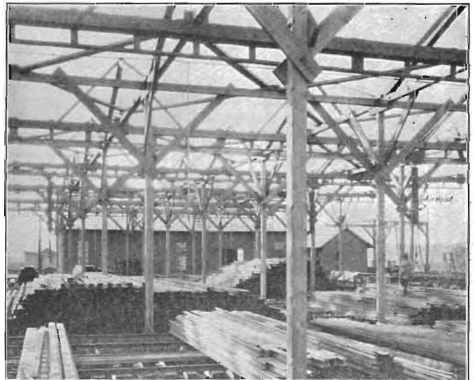
Chicago, Milwaukee & St. Paul Rail Yard, at Savanna, Ill.; Rail Mill in Background.

Most rail is commonly removed from track because of the